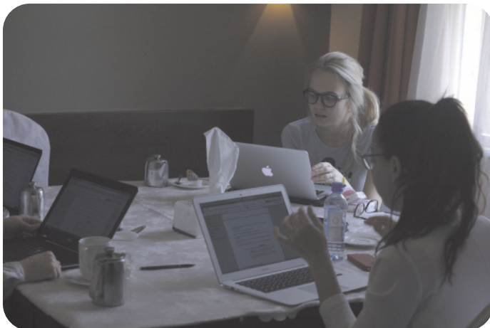
Members of the B3 Africa Work Package 1

In February 2018, the B3Africa consortium held its annual jamboree (last for this funding cycle) in Nairobi, Kenya. Software developers spent the time completing an API for importing mobile data into Baobab LIMS, and configuring the eb3kit for standalone operations. The three day jamboree was followed by a 2-day stakeholder engagement in Naivasha Lodge, Kenya.