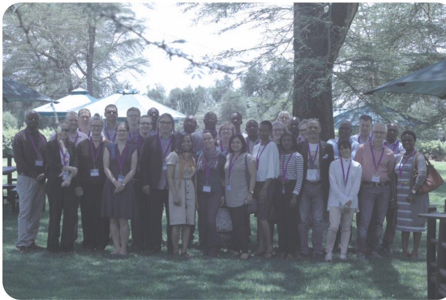
B3 Africa Stakeholders Meeting Naivasha, Kenya 8th - 9th February 2018

The meeting concluded with a commitment to create a working group among African and European stakeholders to develop a strategy for extension funding so that the project can continue.