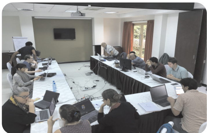
B3 Africa's Software Developers and members of the Education and Dissemination team